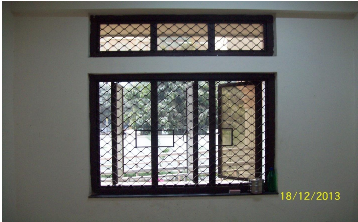
(i) 1600 mm x 1800 mm (L x W)