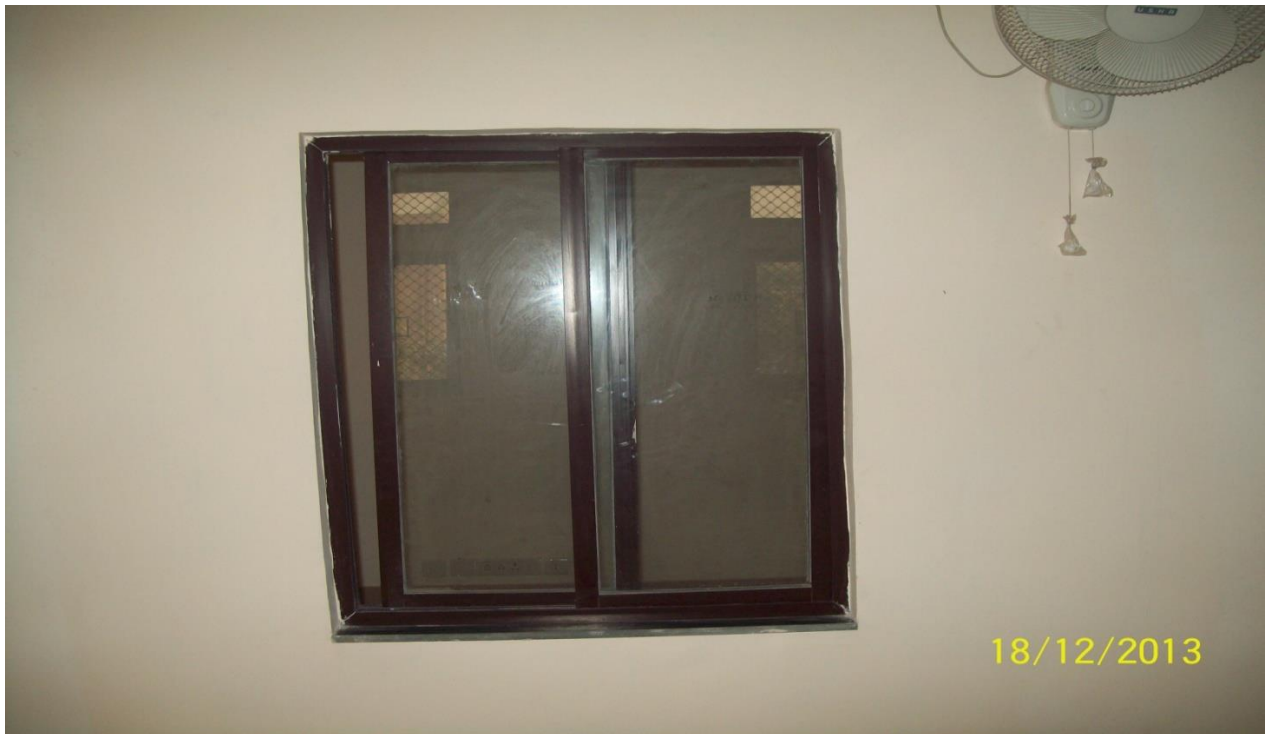
(v) 900 mm x 1200 mm (L x W)