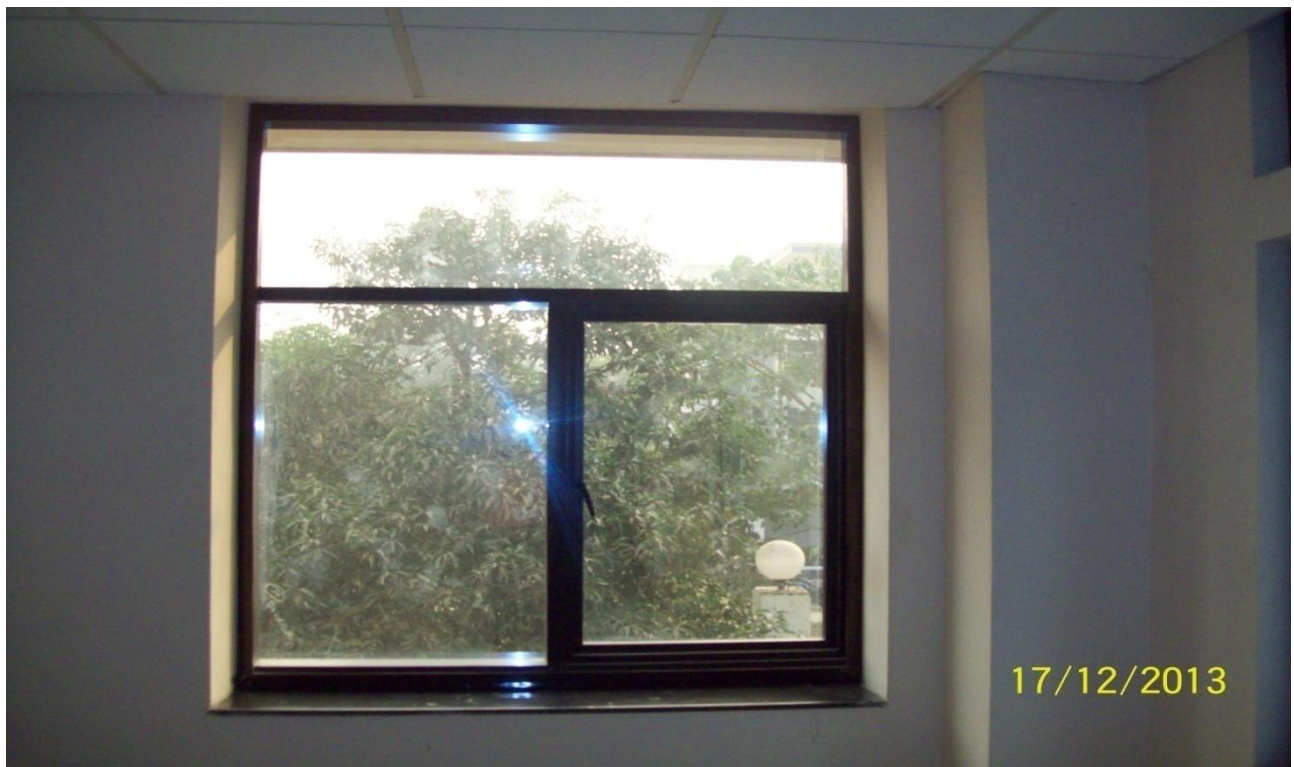
(i) 1600 mm x 1800 mm (L x W)