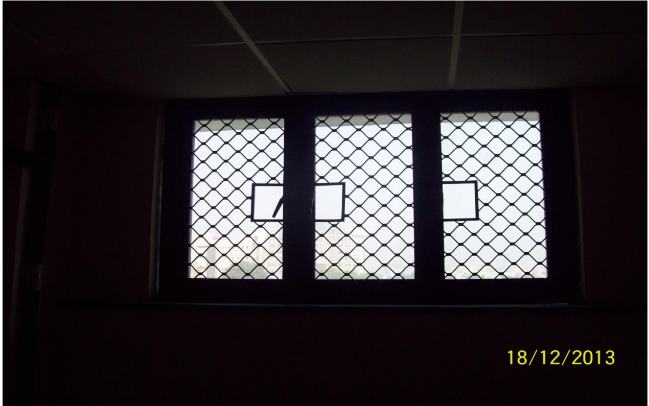
(iv) 1600 mm x 1000 mm (L x W)