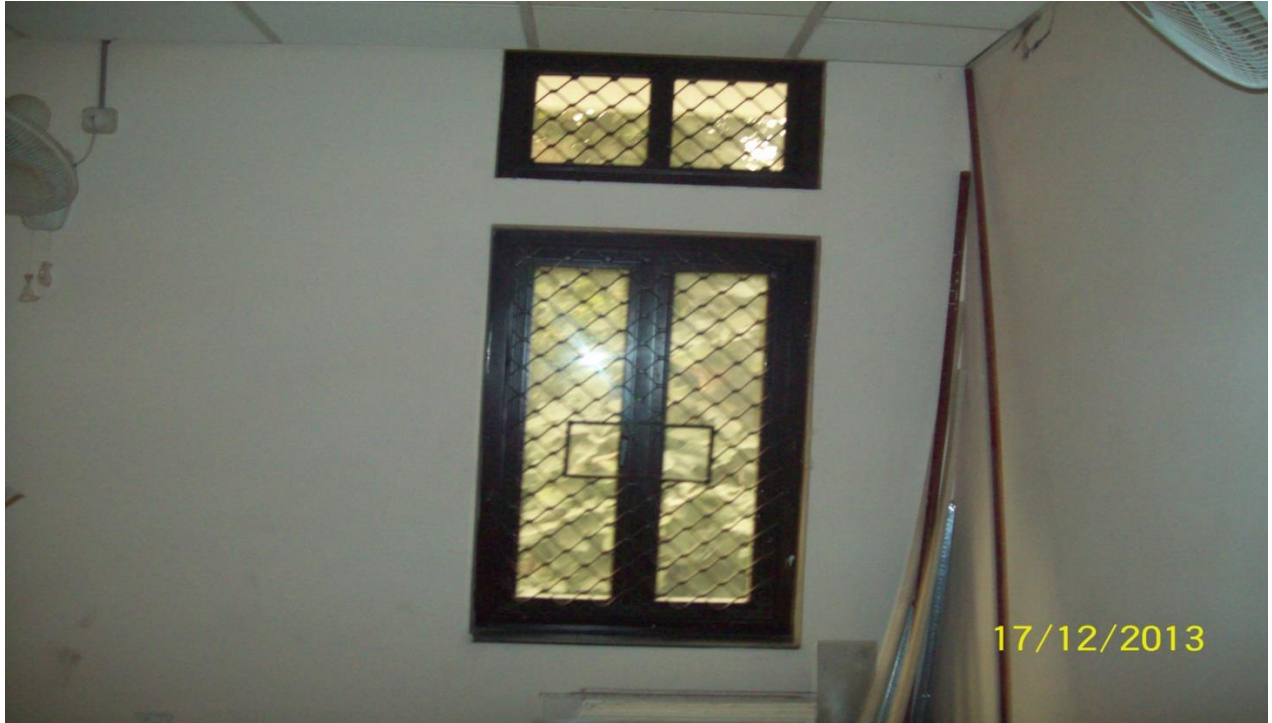
(ii) 900 mm x 1800 mm (L x W)