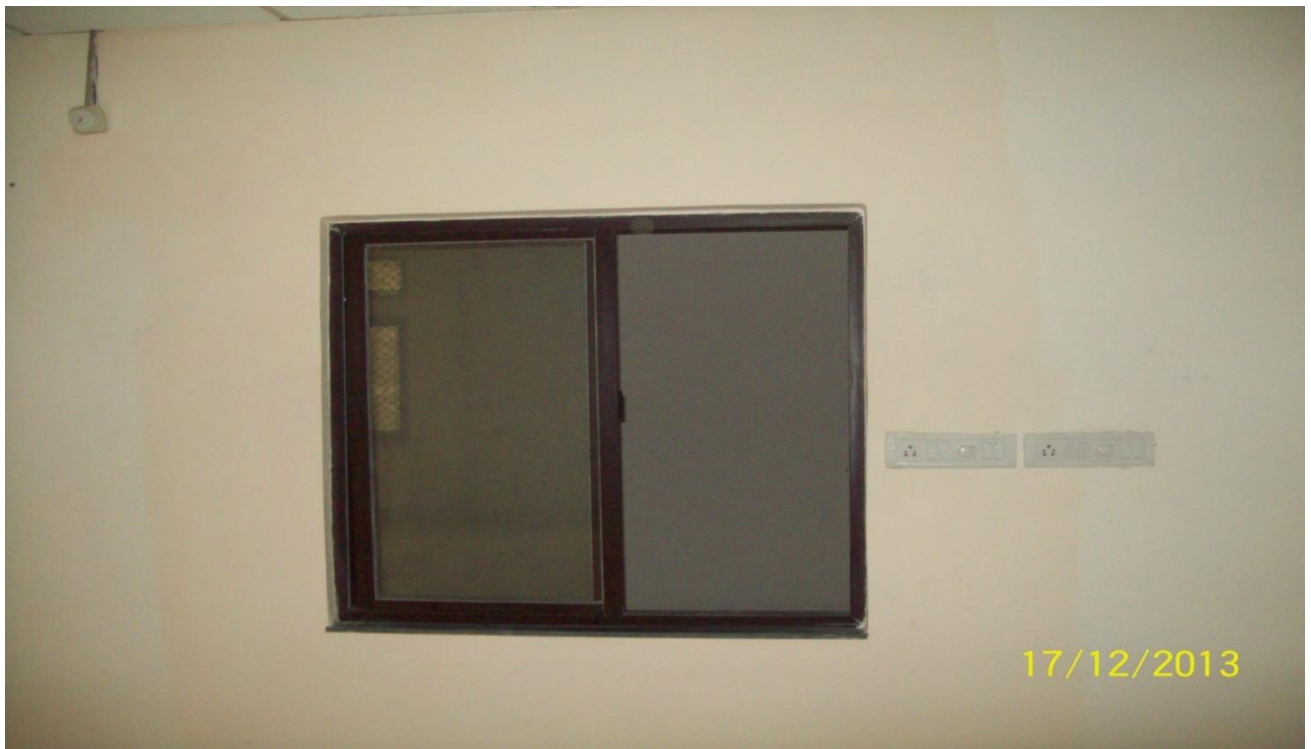
(iii) 1200 mm x 1200 mm (L x W)